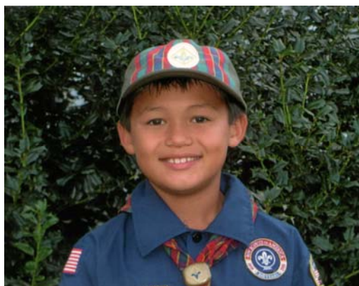
Front of Postcard